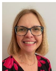
Message from the President

Welcome to a new year with AAUW as we begin the 102nd year of the Wooster Branch. The Board has been working hard this summer planning another year of wonderful programs and insightful book discussions. Please remember when you speak with your friends to invite them to join our great organization. We're always looking for new members!